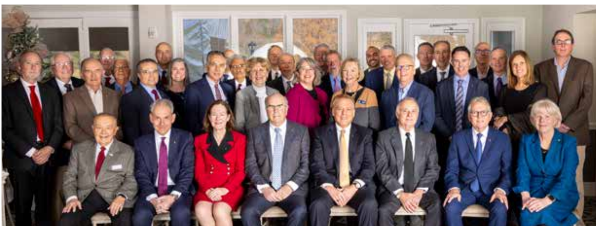
Ives Bank Directors and Corporate Officers